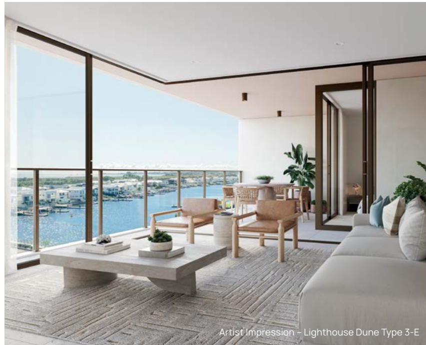
Artist Impression – Lighthouse Dune Type 3-E