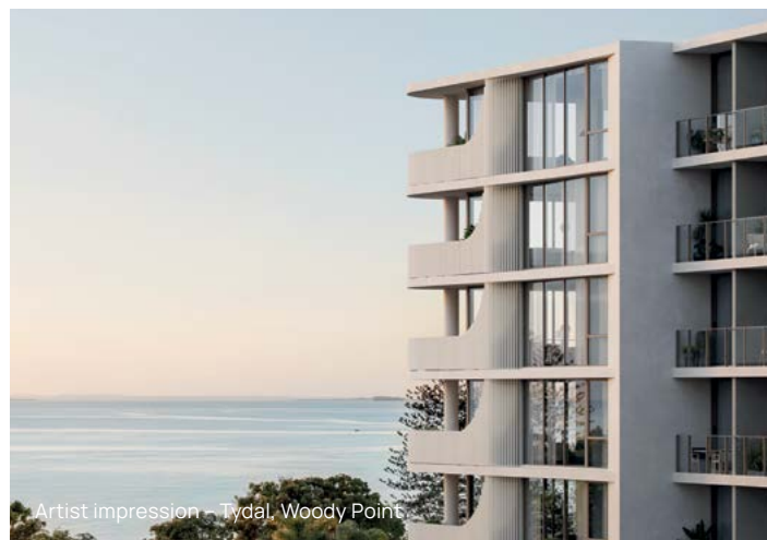
Artist impression - Tydal, Woody Point