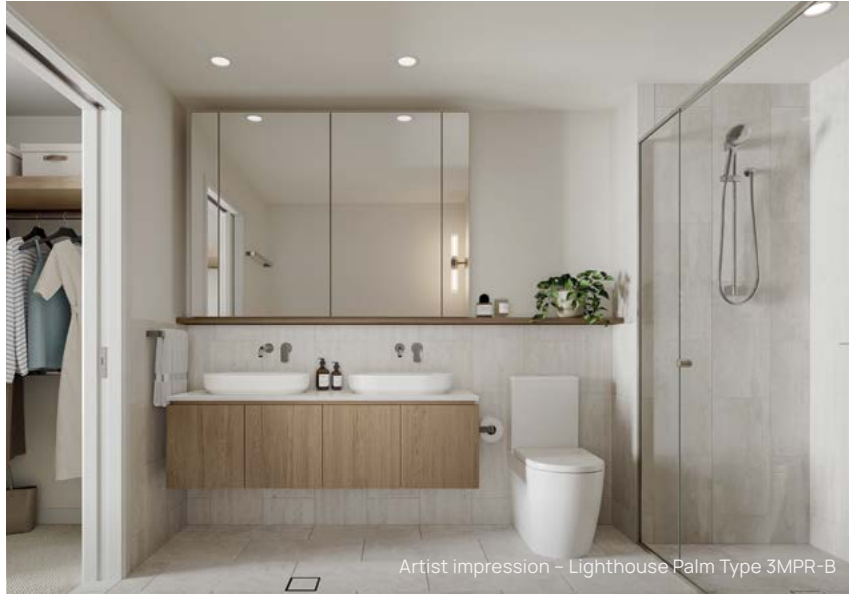
Artist impression - Lighthouse Palm Type 3MPR-B

Retreat to the tranquility of the master bedroom, where you enjoy direct access to your waterfront balcony. An expansive walk-in wardrobe add to the luxurious feel. Recessed LED downlights and feature wall light create a soft ambiance, perfect for unwinding after a long day. Bathrooms feature reconstituted stone benchtops, ceramic basins and bathtubs (where applicable), and quality chrome finished tapware.