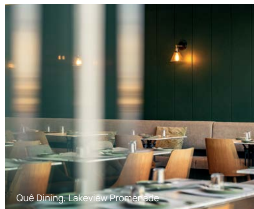
Quê Dining, Lakeview Promenade