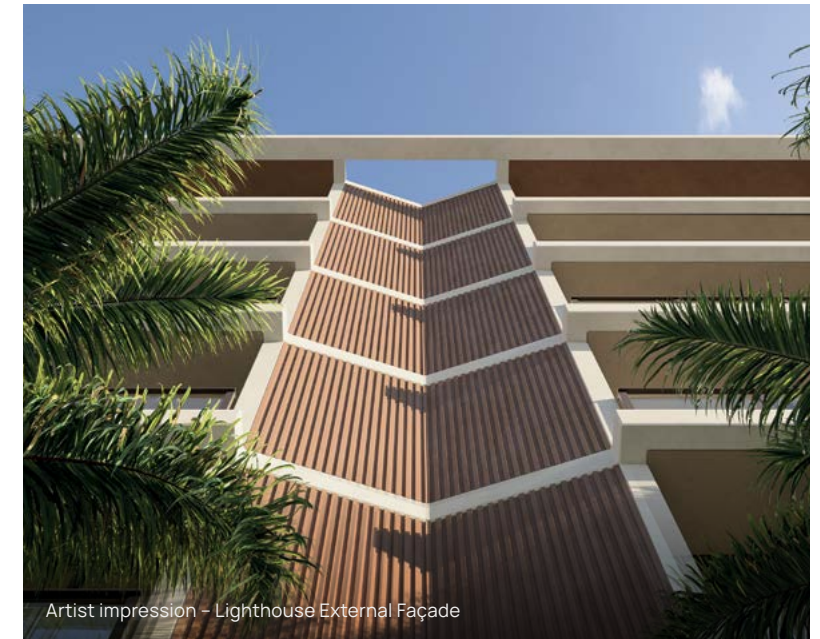
Artist impression - Lighthouse External Façade