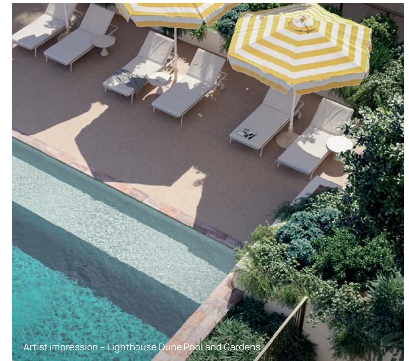
Artist impression – Lighthouse Dune Pool and Gardens