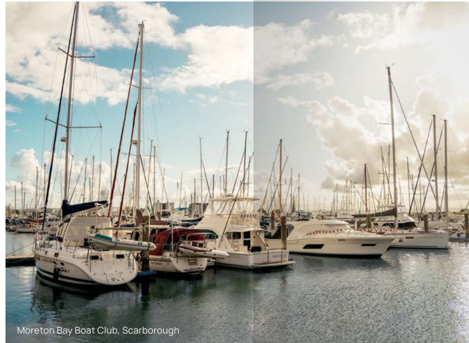
Moreton Bay Boat Club, Scarborough