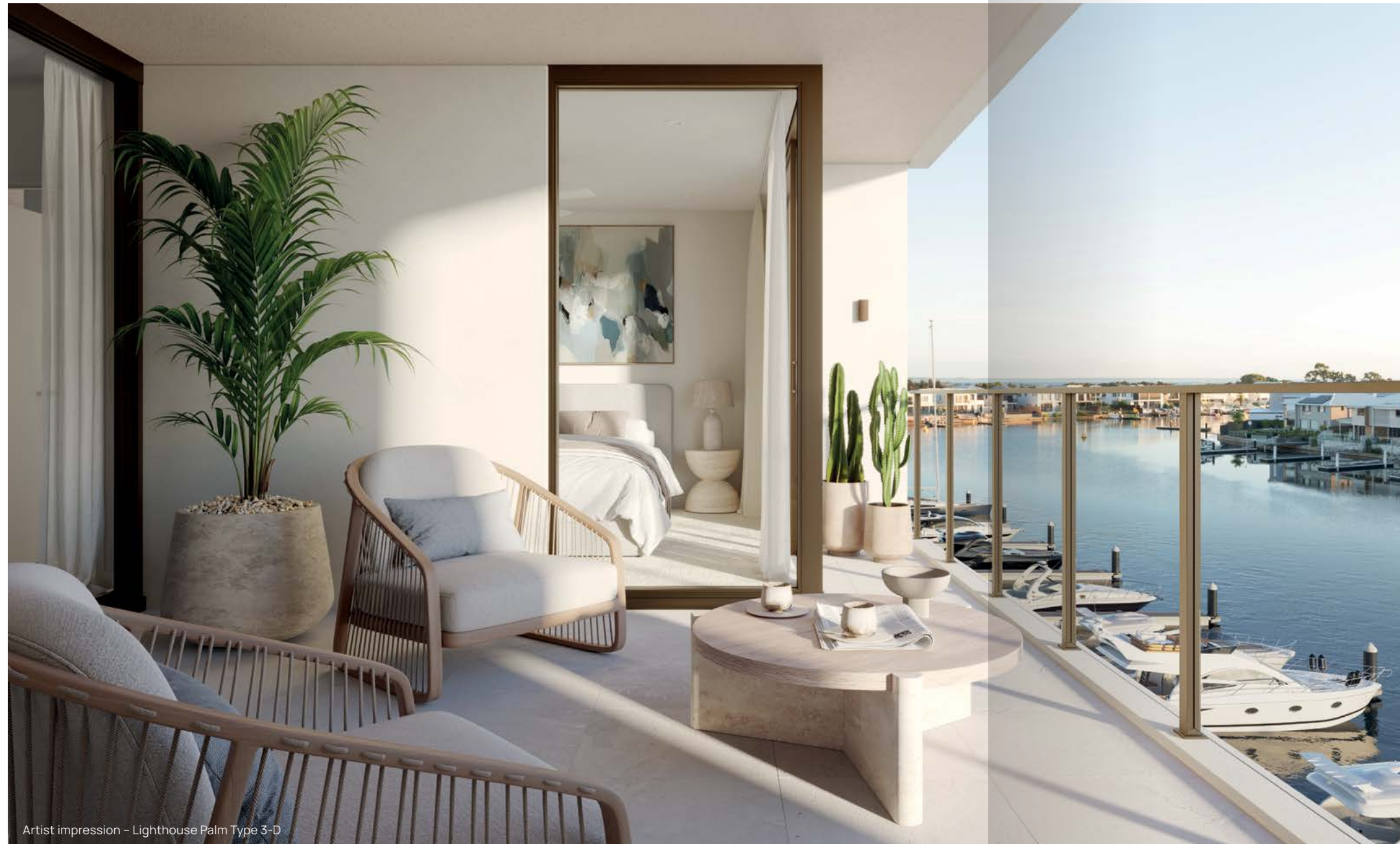
Artist impression – Lighthouse Palm Type 3-D

The true brilliance of Lighthouse living lies in the seamless connection between indoors and out. Whether it's an expansive waterfront balcony or a lushly landscaped private courtyard, these spaces become an extension of your living room, perfect for outdoor entertaining, quiet relaxation, or simply watching the boats glide by.