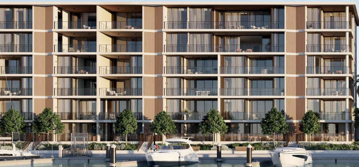
Artist impression – Lighthouse Palm and Dune