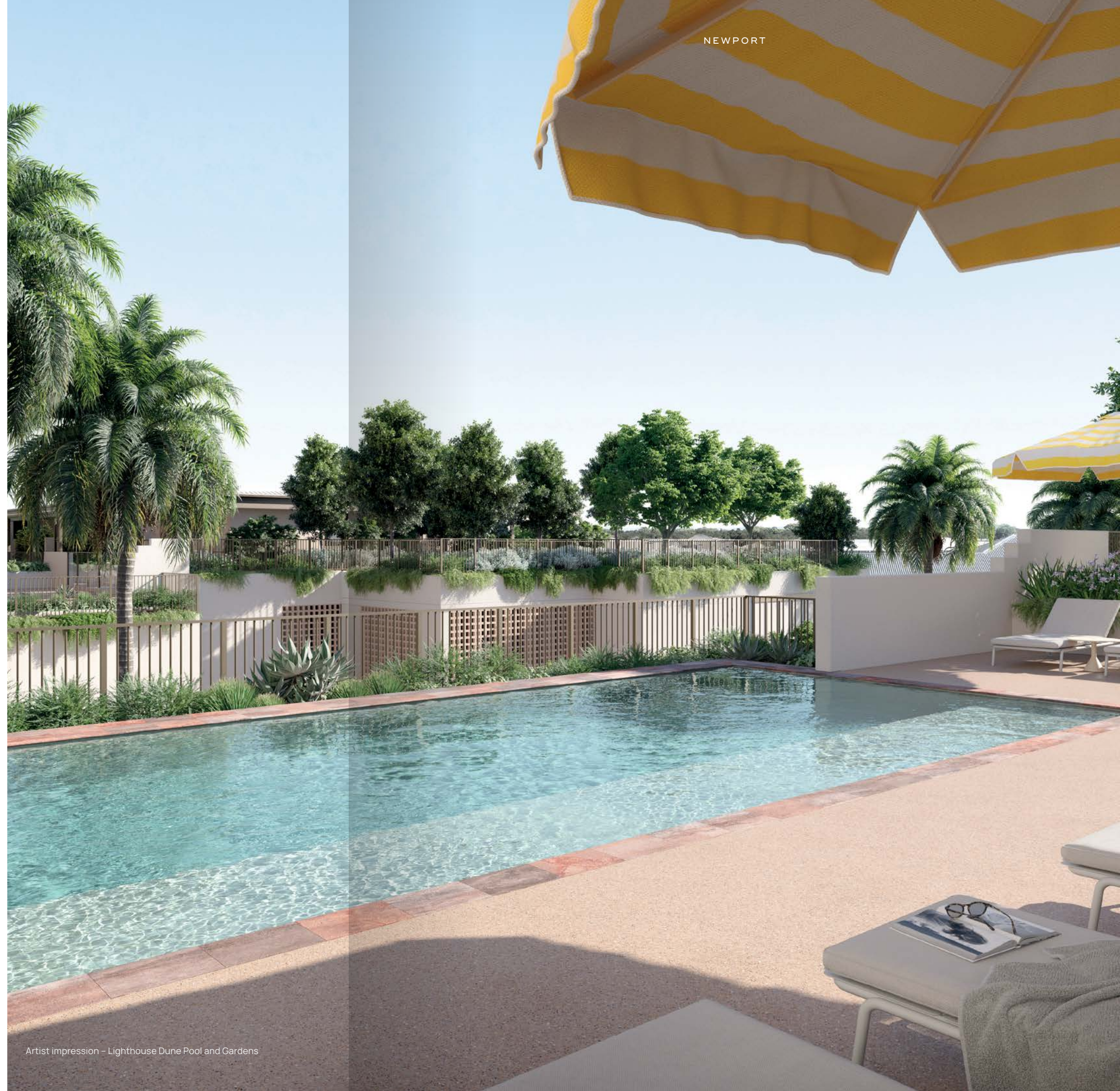
Artist impression – Lighthouse Dune Pool and Gardens

Beyond the front door, the 22-berth Lighthouse Marina forms an integral part of this absolute waterfront experience, providing both a stunning backdrop and easy access to Moreton Bay and beyond.