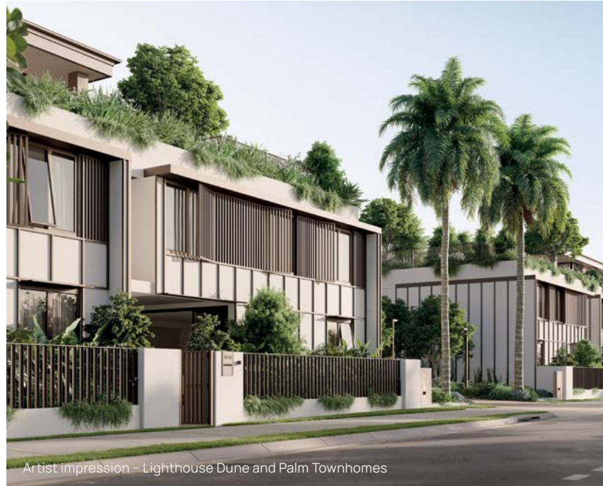
Artist impression – Lighthouse Dune and Palm Townhomes