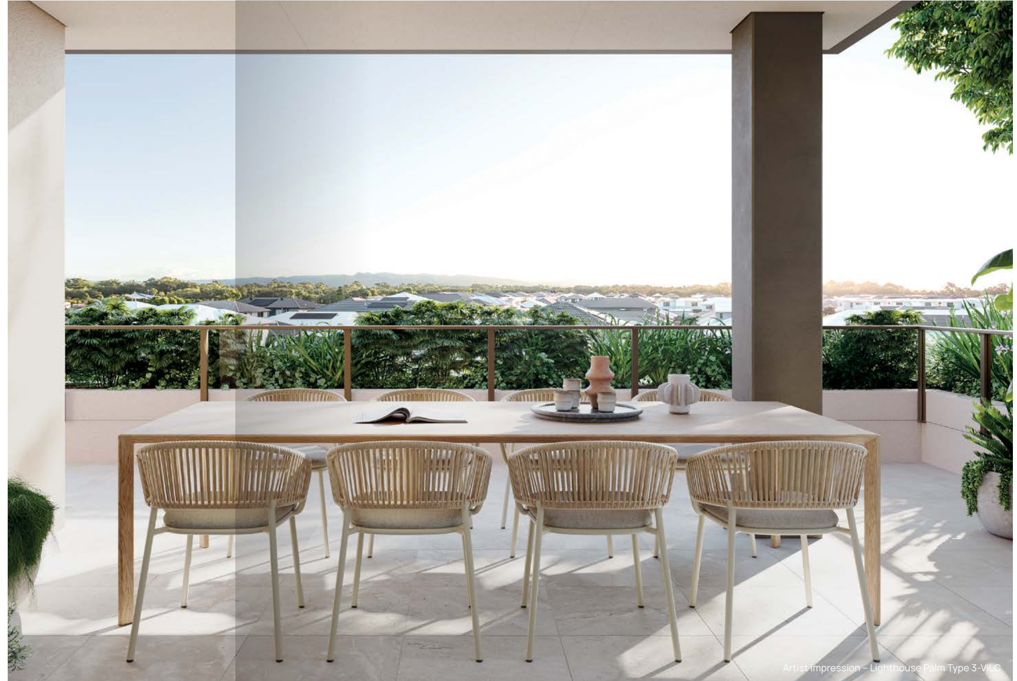
Artist impression – Lighthouse Palm Type 3-VILC

These homes are thoughtfully connected to the neighbourhood via Trinity Street and Lakeview Park, with each featuring a secure pedestrian entry from the street. Their distinctive design, defined by vertical screening, strikes a considered balance between privacy and community while enhancing the streetscape with texture and greenery.