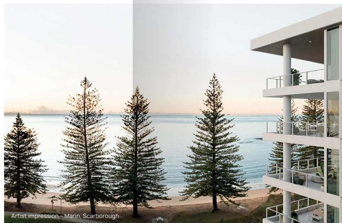
Artist impression - Marin, Scarborough