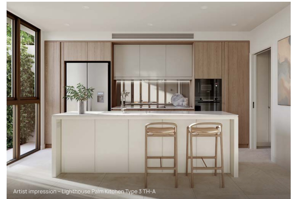
Artist impression – Lighthouse Palm Kitchen Type 3 TH-A

Warmth and authenticity radiate from every corner, with a curated selection of materials and textures creating a sophisticated yet carefree coastal ambiance.