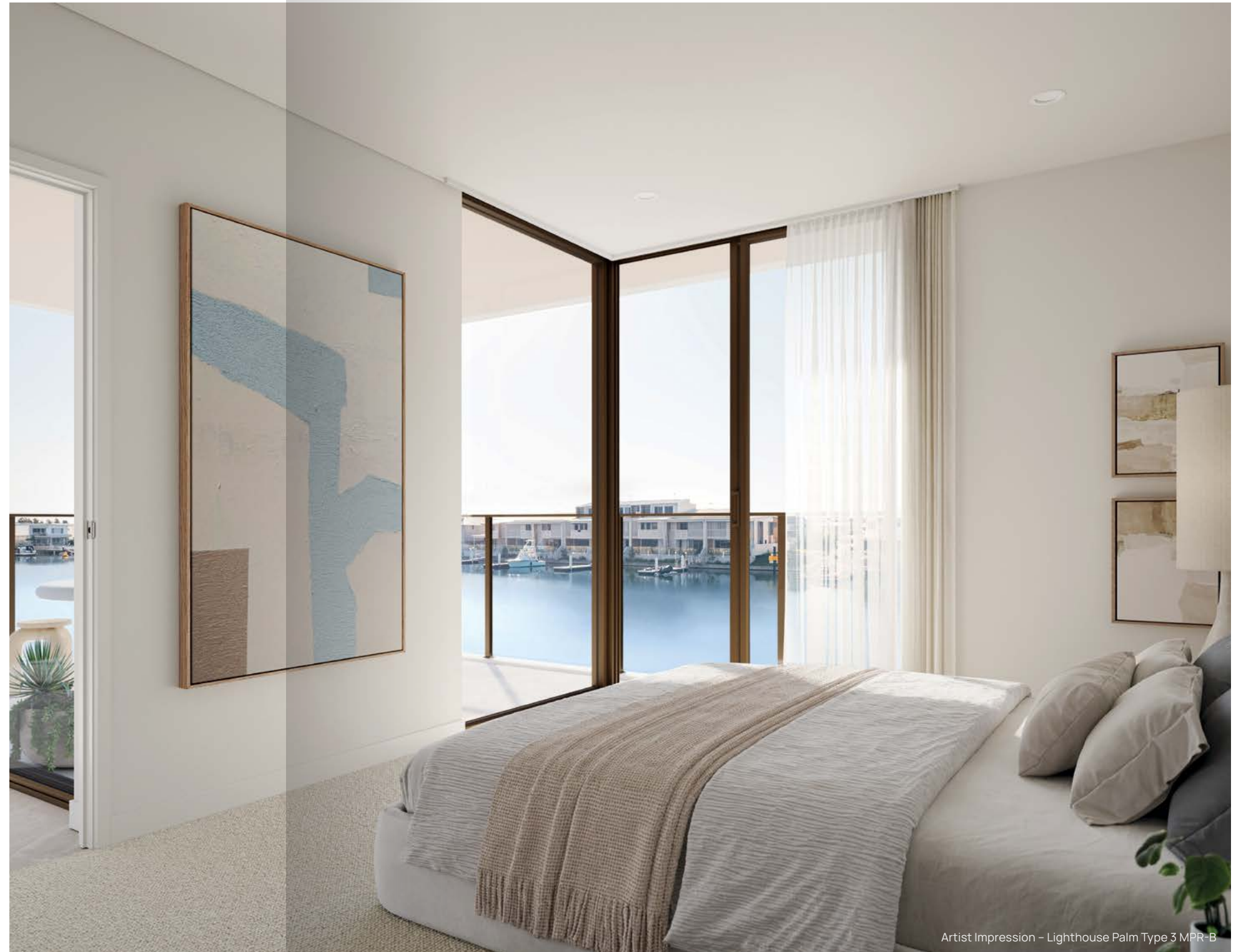
Artist Impression - Lighthouse Palm Type 3 MPR-B