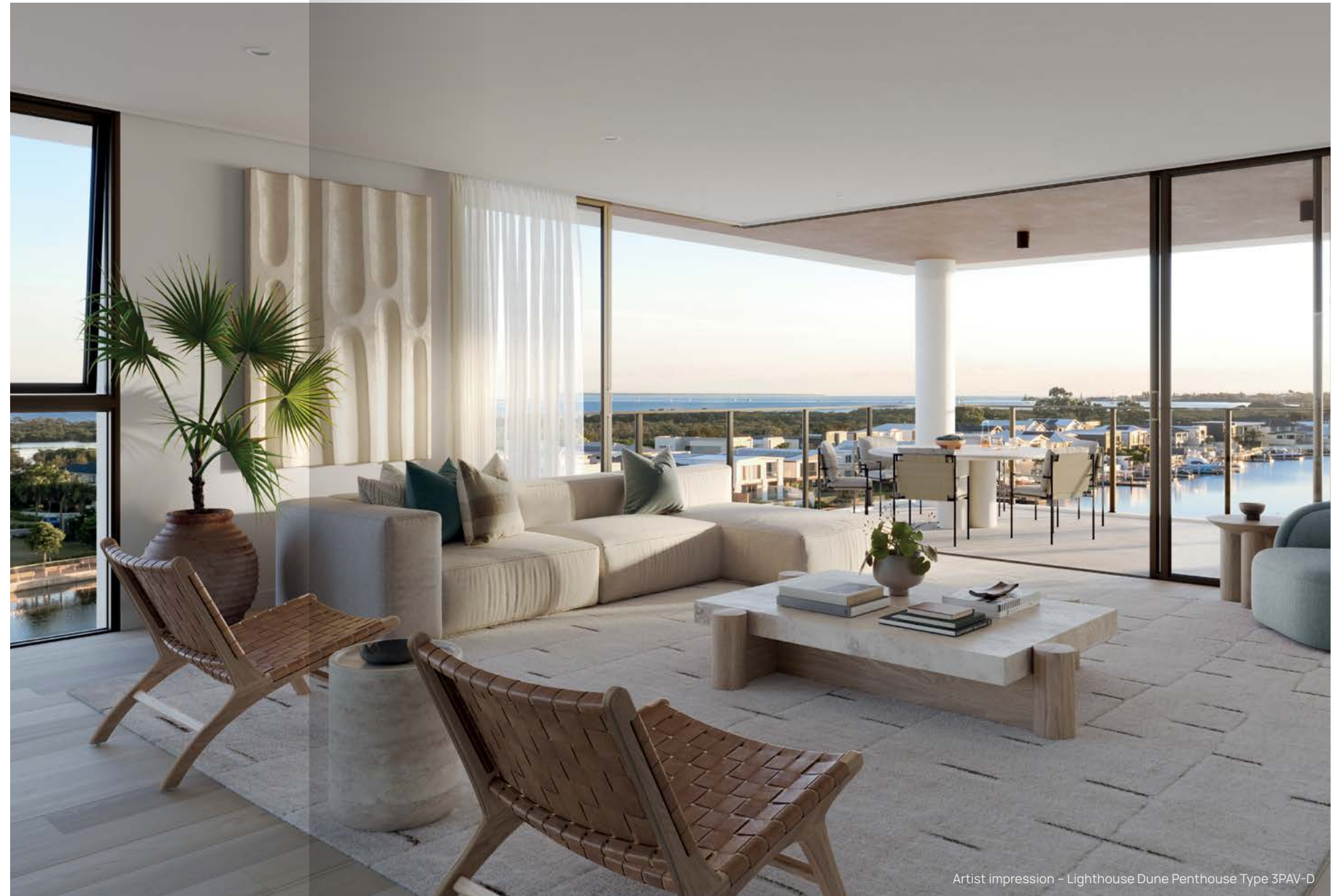
Artist impression – Lighthouse Dune Penthouse Type 3PAV-D

Lighthouse's 2 & 3 bedroom apartments offer a range of layouts and extensive space to entertain, unwind, work, or study. Each residence features a generous open-plan kitchen, living, and dining area, flowing to a private balcony perfect for alfresco dining. The master bedroom features a walk-in wardrobe and ensuite bathroom with double vanity. A separate laundry and clever storage ensures every apartment is designed to maximise space and light, creating a comfortable and elegant coastal home.